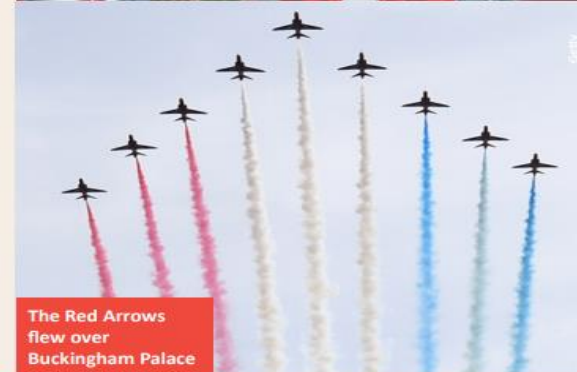
The Red Arrows flew over Buckingham Palace