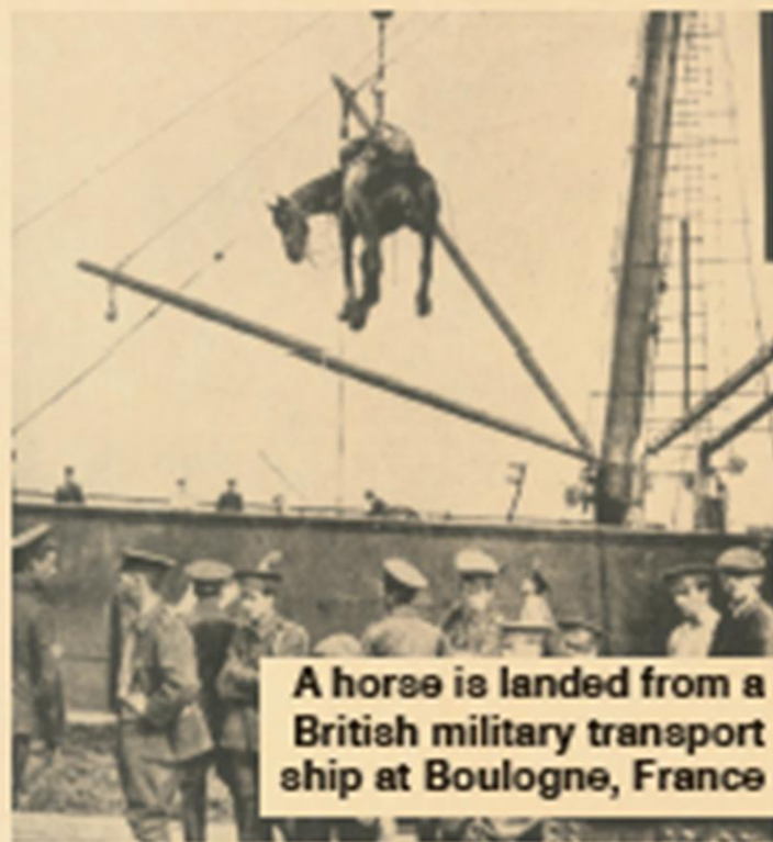
A horse is landed from a British military transport ship at Boulogne, France

Lizzie's job is to cart equipment, machines and scrap metal around Sheffield, a job that used to be done by three horses taken off to war.