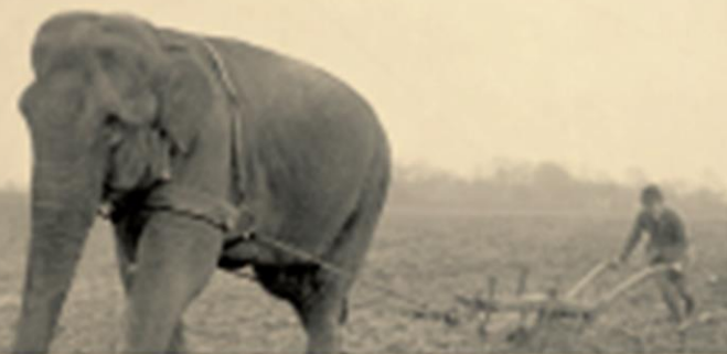
Elephants from Sangar's Circus are being used to plough fields in Horley, Surrey