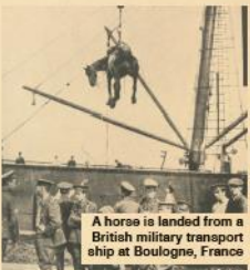
A horse is landed from a British military transport ship at Boulogne, France

Hundreds of thousands of horses and mules are being used by Britain in the war. Most of our heavy horses have already gone to the front, with many being killed or injured. The Blue Cross charity is raising funds for their treatment.