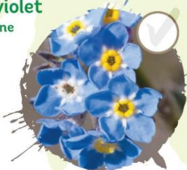
Wood forget-me-not See it: April–June