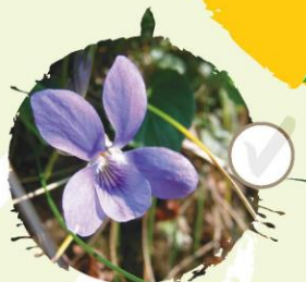
Common dog violet See it: April–June