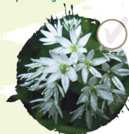
Ramsons (wild garlic) See it: April–May