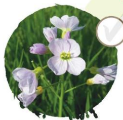
Cuckooflower See it: April–June