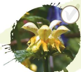
Yellow archangel See it: May–June