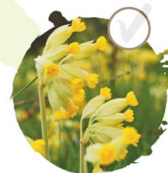
Cowslip See it: April–May