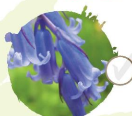
Bluebell See it: April–May