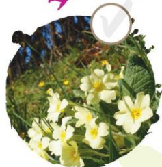
Primrose See it: December–May

Bright colours and delicate petals How many will you spot?