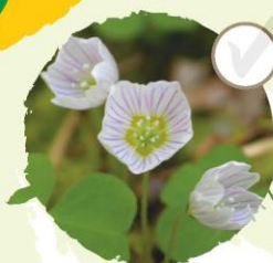
Wood sorrel See it: April–May