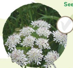
Cow parsley See it: May–June