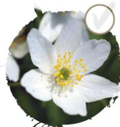
Wood anemone See it: March–May