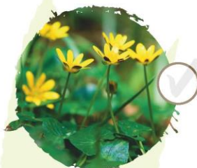
Lesser celandine See it: March–May