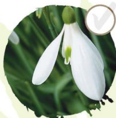
Snowdrop See it: January–March