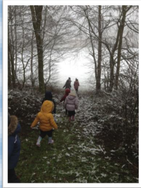
Foundation Stage engaged in outdoor learning

All pupils within the Foundation Stage engage in a range of learning experiences based upon the Early Years Foundation Stage Curriculum; 3 Prime areas (personal, social and emotional development, communication and language development and physical development) and 5 Specific areas (literacy, mathematics, understanding of the world, expressive arts and design and spiritual development).