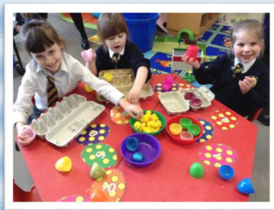
Foundation Stage engaged in practical maths activities

In Key Stages One and Two all pupils access the National Curriculum which consists of the following areas: