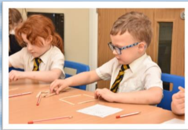
Key Stage One working practically in maths

All pupils are taught to develop efficient strategies for mental and written calculations which are clearly outlined within our school policy