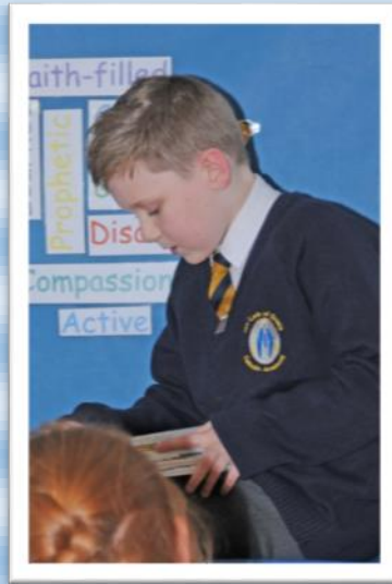
Our children leading collective worship

During Lent and Advent, liturgies take place during school. These prayer group sessions are led by staff and pupils. During the months of May and October a Rosary Club which operates before school gives parents and pupils the opportunity to prayer together.