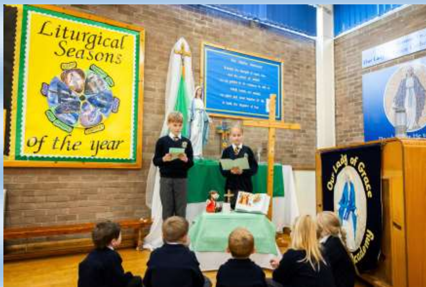
Our children leading collective worship

During Lent and Advent, prayer services take place during school. These prayer group sessions are led by staff and pupils. During the months of May and October a Rosary Club which operates before school gives parents and pupils the opportunity to prayer together.