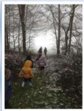
Foundation Stage engaged in outdoor learning

All pupils within the Foundation Stage engage in a range of learning experiences based upon the Early Years Foundation Stage Curriculum; 3 Prime areas (personal, social and emotional development, communication and language development and physical development) and 5 Specific areas (literacy, mathematics, understanding of the world, expressive arts and design and spiritual development).