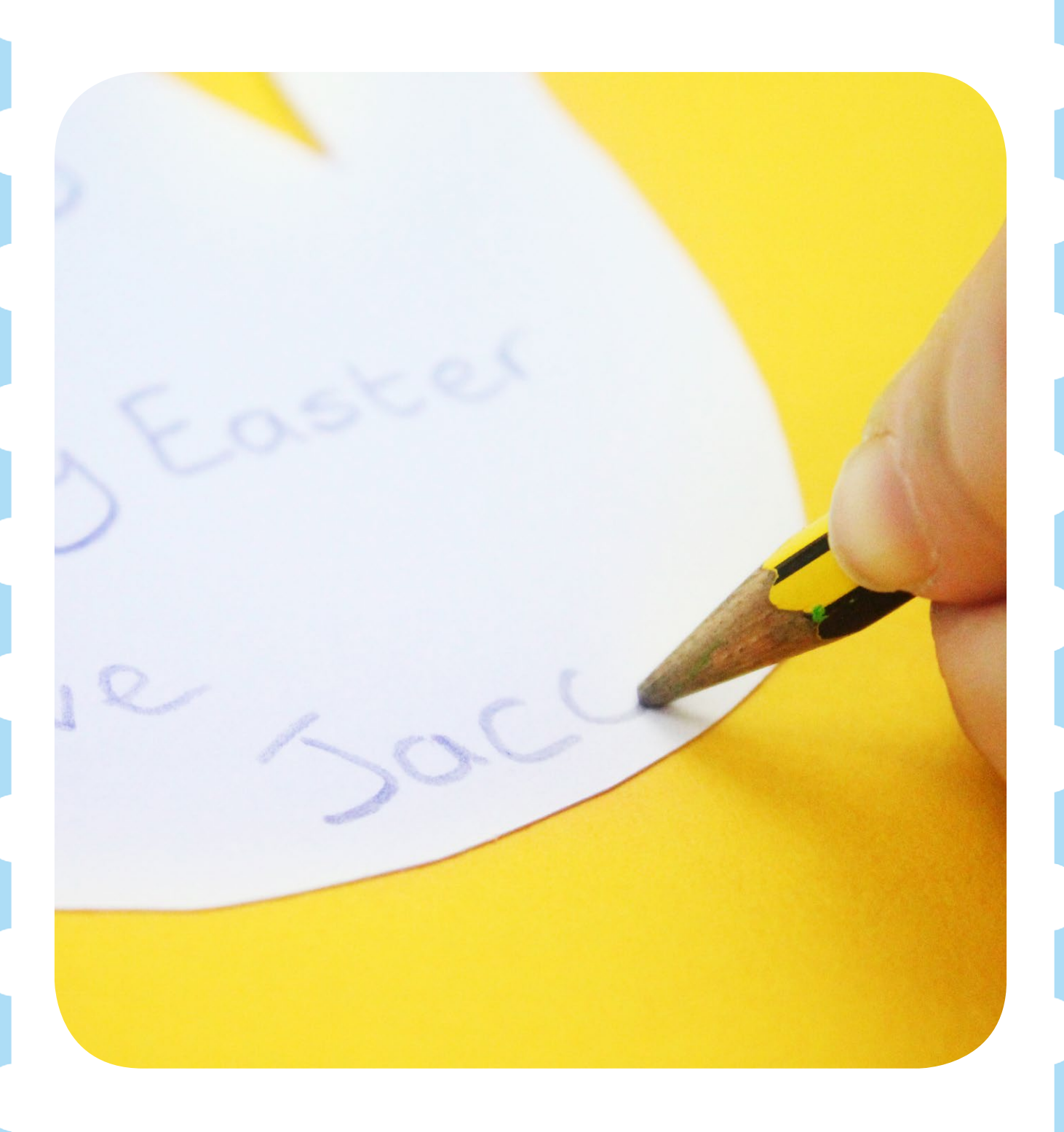
Step 7: Write a message inside the card.