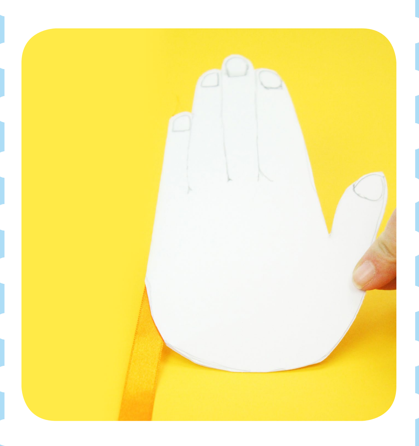
Step 6: Glue the ribbon inside the hands along the right side of the fold.