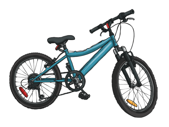
bicycles to help workers get to work

Fairtrade means that farmers get a regular wage for their goods. They can also get extra money to develop their community and protect their environment.