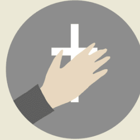
Fear of the lord