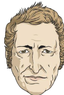
Thomas Robert Malthus (1766 – 1834)

Argued that animals struggled for existence, resources, to breed and avoid being eaten. Those that were successful were better able to survive.