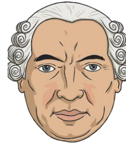
Georges-Louis Leclerc (1707 – 1788) French Philosopher

Animals and plants that survived seem like they were created that way but it was actually accidental that they did.