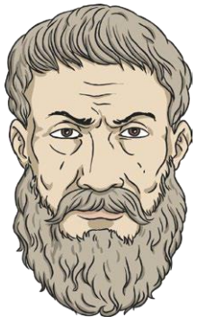
Epicurus (341 – 270 BC) Greek Philosopher

Emphasised how environmental changes could lead to natural selection (adaptive traits).