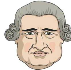
Erasmus Darwin (1731 - 1802) English Physician

Only those that functioned the best survived and had offspring.