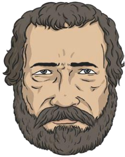
Empedocles (c. 490 – 430 BC) Greek Philosopher

Thought only some animals and plants survived, others die.