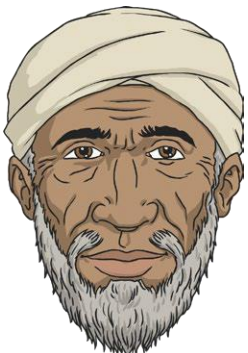
Al-Jahiz (776 – 868) Arab Prose Writer

Said that 'one and the same kind of living filament is and has been the cause of all organic life'. This means that all living things have a common ancestor.